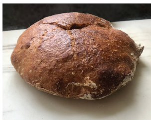
Abbie's Sourdough Bread