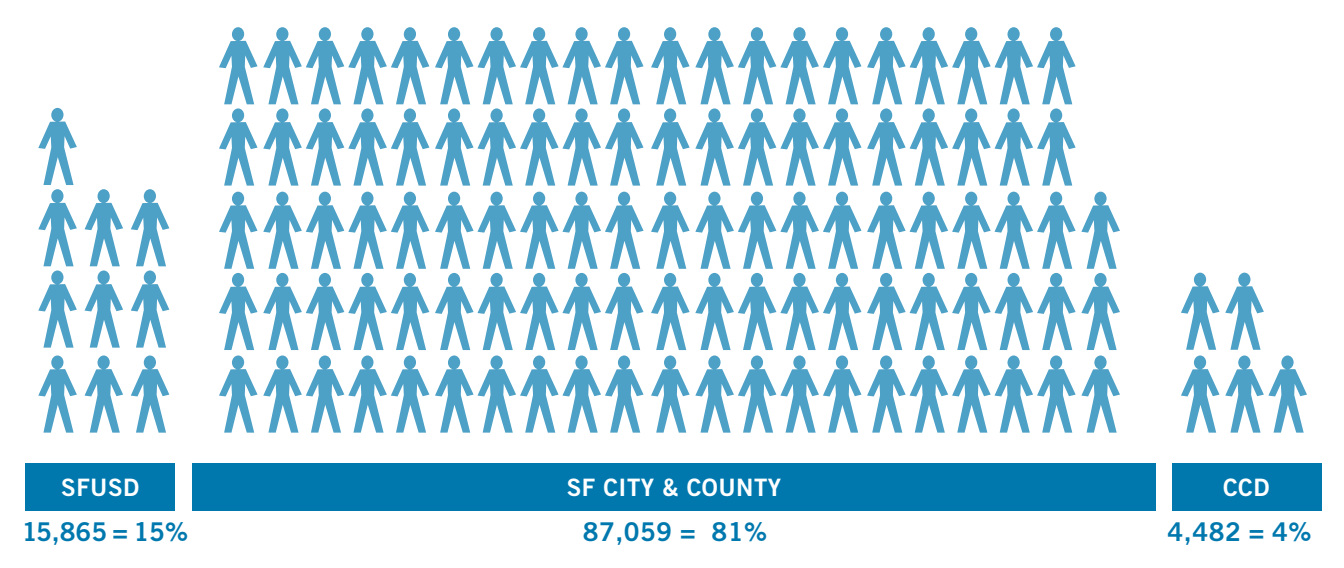
TOTAL LIVES COVERED = 107,406

The Health Service System provides medical benefits to eligible employees and retirees of four major San Francisco public-sector employers—the City and County of San Francisco, the San Francisco Unified School District, the City College of San Francisco and the San Francisco Superior Court. As of July 1, 2007, HSS members totaled 107,406 covered lives. This reflected an increase of 1,857 in total covered lives under HSS medical plans since July 1, 2006.